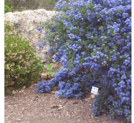
Patrick Pizzo Volunteer-supplied label identifies this blooming shrub along Capitancillos Drive as a ceanothus 'Concha'

In 2002, I began to plant compatible native shrubs along and between the oaks. Most are native, although there is a smidgen of Mediterranean plants interspersed. Some plants pre-existed and these were included in the project.