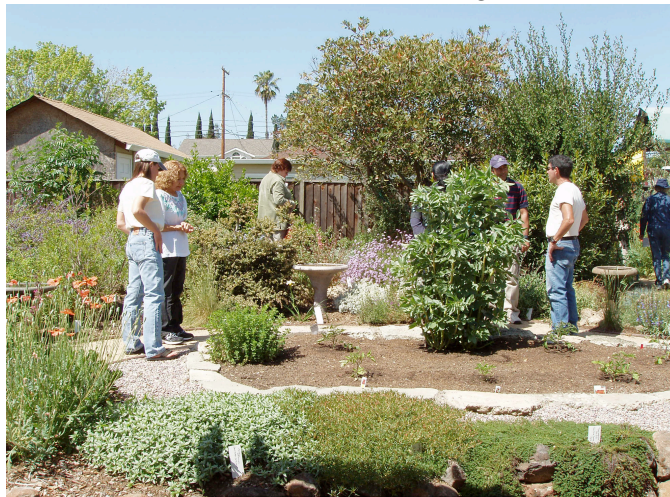
The Citta garden in Cupertino, which received 258 visitors in the 2010 Going Native Garden Tour

Chapter field trips are free and open to the public. They are oriented to conservation, protection and enjoyment of California native plants and wildlife, and we adhere to all rules and guidelines for the lands on which we are visiting.