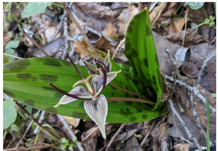
Fetid adder's tongue, San Francisco Water District land, February 2018