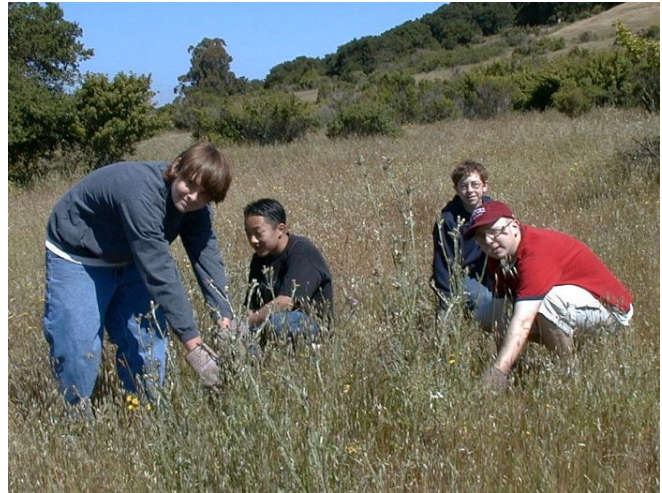
Friends of Edgewood A group of Saturday morning weeders at Edgewood Park, May 2002.

them if we find any new invasives. We keep up to date on restoration protocols through Cal-IPC events and other sources. I also meet with the Edgewood docents and docent trainees, and have them come out to the “wilds of Edgewood,” showing them what we are working on and why it is so important. Many end up learning as they weed with us.