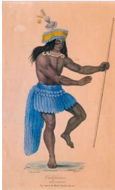
Ohlone dancer by L. Massard from Otto von Kotzebue's "Voyage Autour du Monde," circa 1830

The Chapter board approved the following land acknowledgement at the June 17, 2021 board meeting: